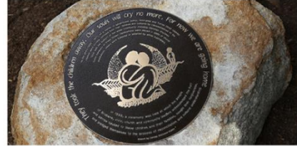
Image reference - Reconciliation Garden to be opened in St Stephen's Cathedral precinct this Sunday - The Catholic Leader

This year, we are seeing more examples of milestones being reached towards reconciliation. In February the Archdiocese of Brisbane embarked on a journey to create a Reconciliation Garden at St Stephens Cathedral.