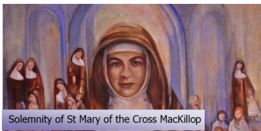
Solemnity of St Mary of the Cross MacKillop

A Youth and Family Mass is held on the second Sunday on the month. Our next mass will be held on August 14 th at the 6pm mass at St Agnes Church, this will be followed by hospitality.