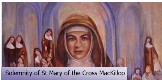
Solemnity of St Mary of the Cross MacKillop

St Agnes' School will be celebrating its 60 th Anniversary at the regular Thursday morning mass this coming week.