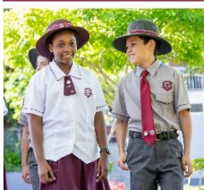
A COVID-19 Safe Event

Please register online www.clairvaux-mackillop.edu.au via the Enrolments tab or telephone 3347 9275